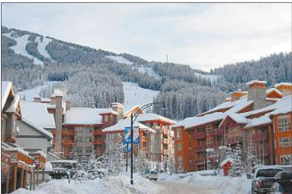
At Panorama Mountain Village, owners can visit when properties are free.

Not a bad deal, considering in just 14 months, Luxus has acquired properties in easily accessible vacation hot spots such as Canmore, Vernon, Scottsdale, Palm Springs, Maui, Las Vegas, Cabo Sans Lucas and New York. Plans are to expand to "30 properties in 20 destina-