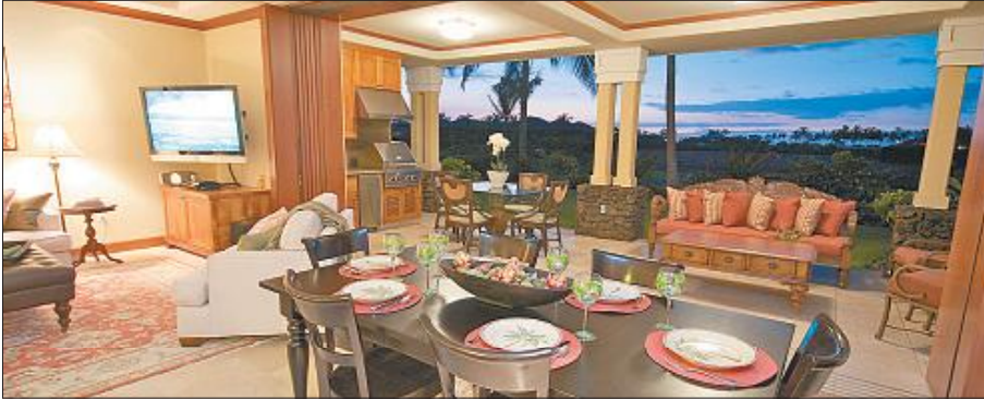
Luxus Vacation Properties runs like a mutual fund, pooling investor money to buy vacation properties like this one in Hawaii.